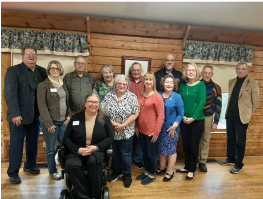
Some Friend's of the Library Board Members--past and present.